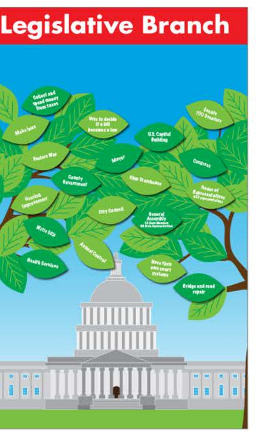
Branches of Government Poster Peter Santagate