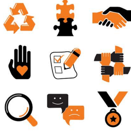
Character Education Corryn Muench 7 TH & 8 TH GRADE