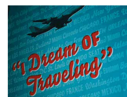
Dream Station: Travel