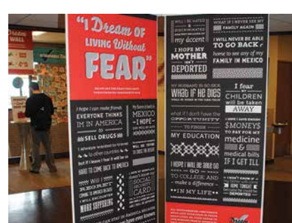
Dream Station: No Fear