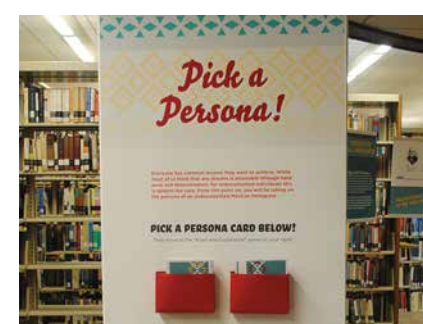
Pick a Persona