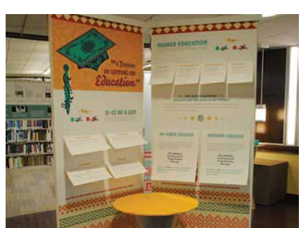
Dream Station: Education