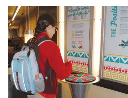
Dream Station: Family