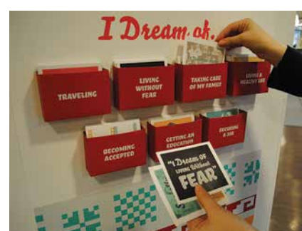
Choose Your Dreams