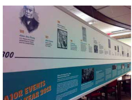
History of Immigration