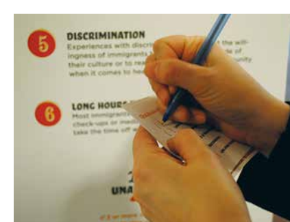
Dream Station: Health