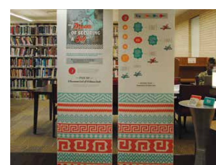
Dream Station: Job