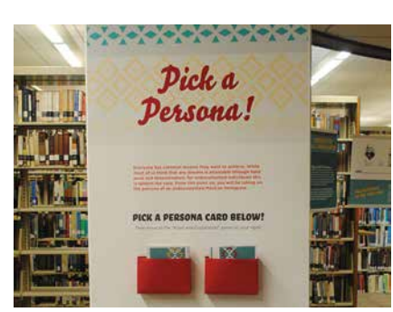
Pick a Persona