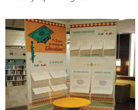
Dream Station: Education