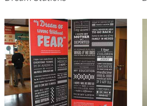
Dream Station: No Fear