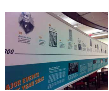
History of Immigration