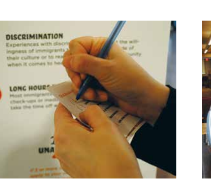
Dream Station: Health