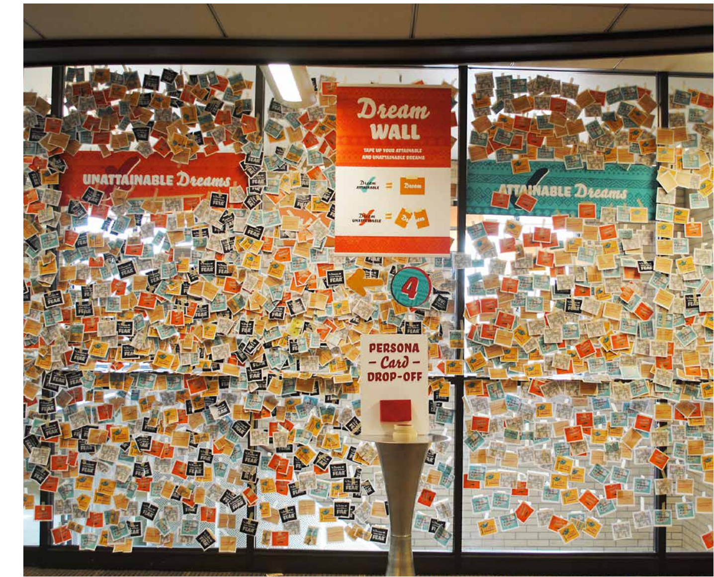
Dream Wall: Attainable Dreams vs. Unattainable Dreams