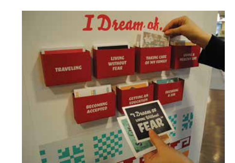
Choose Your Dreams